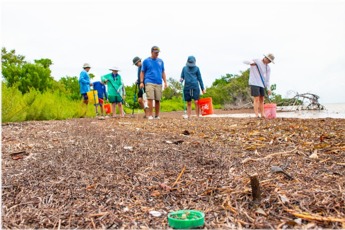
Island Expedition crew cleaning up the beach during their service project at on of the Florida Keys' State Parks

Can I bring my CPAP Machine on my Adventure? Participants who sleep with a CPAP machine may participate at Sea Base if they have been medically cleared for participation. CPAP users must understand that they are responsible to provide battery support for their CPAP and may not have access to electricity if participating in Bahamas, St. Thomas, St. Croix, Florida Keys Sailing, Live Aboard Diving, Keys Adventure or Out Island programs.